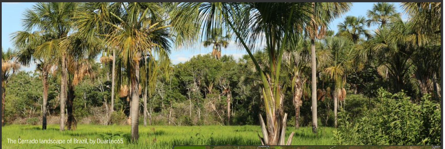
The Cerrado landscape of Brazil, by Duarte65

some of the oldest evidence of human presence in the Americas in its rich archaeological sites that date back 50,000 years. It is recognized as a UNESCO World Heritage Site for its outstanding cultural and natural significance. This expansion plans to grant the highest level of national protection to some of the last remaining areas of highly intact, old-growth forest in the Caatinga, adjacent to the existing park and providing connectivity to the nearby 2-million-acre Serra das Confusões National Park.