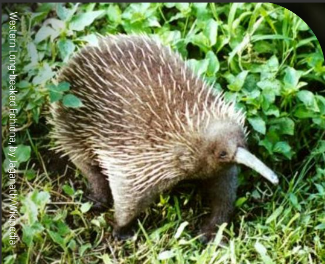
Western Long-beaked Echidna, by Jaganath/Wikipedia