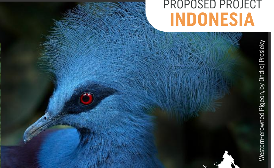
Western-crowned Pigeon, by Ondrej Proszicky