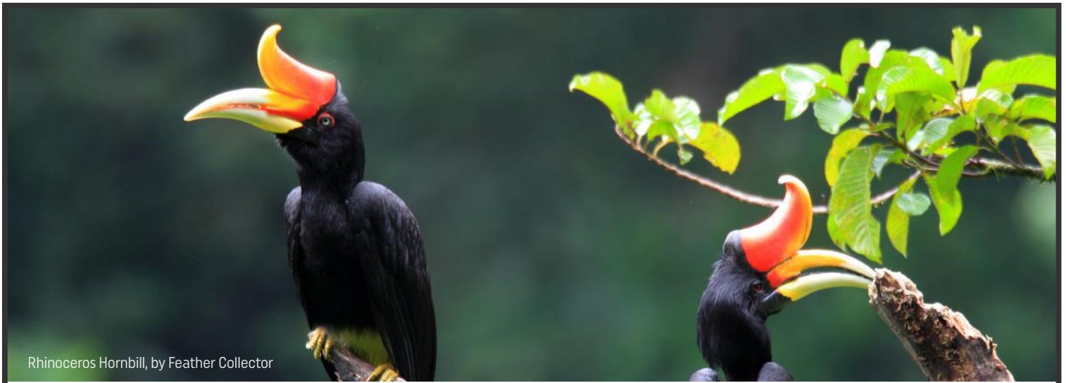
Rhinoceros Hornbill, by Feather Collector