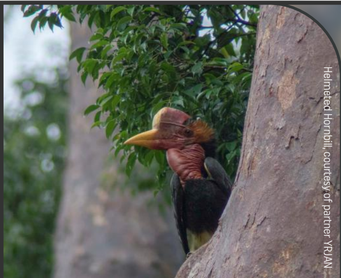
Helmeted Hornbill