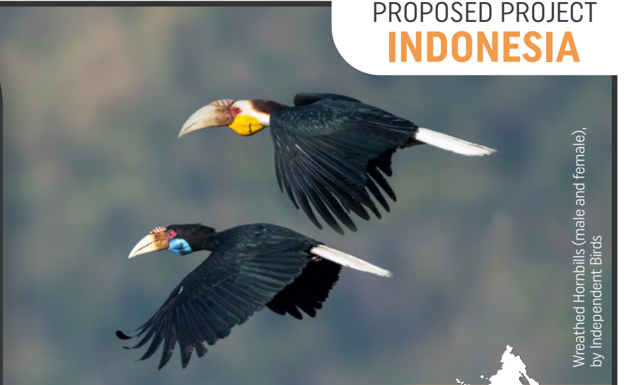
Wreathed Hornbills (male and female), by Independent Birds